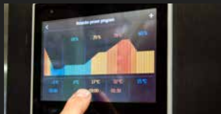
User-friendly touch function control panel simplifies everyday life.

Choice of colors: Neutral stainless steel or black.