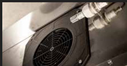
Fans run on demand to save energy and provide the perfect proving climate.