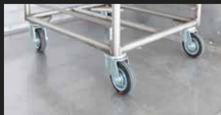
Insulated heated floor that prevents cold damage to underlying materials.